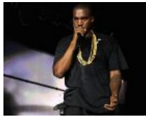
Kanye West takes to Twitter to muse about racial, misogynistic lingo in rap music