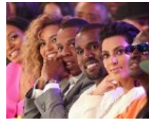
Im A Diva: 20 Demanding Celebs And Their Over The Top Requirements (Bossip)