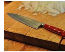
Woman Stabs Boyfriend After He Slaps Her Sunburned Bottom (CafeMom)